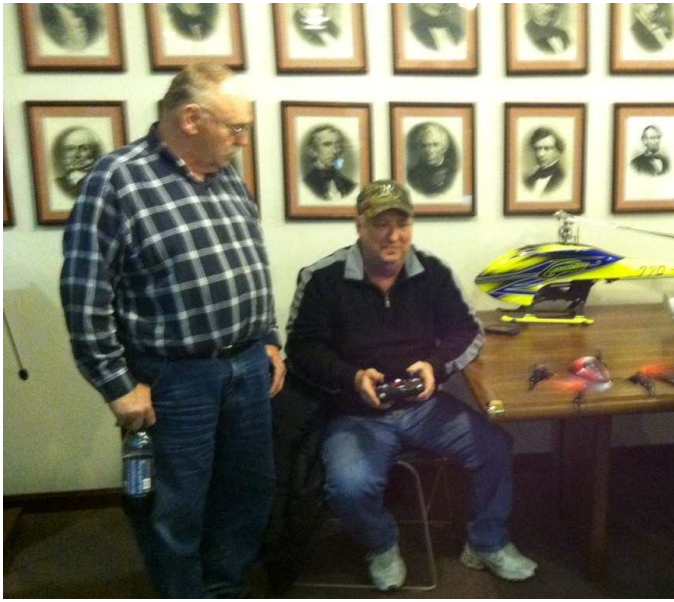
Kids and their toys