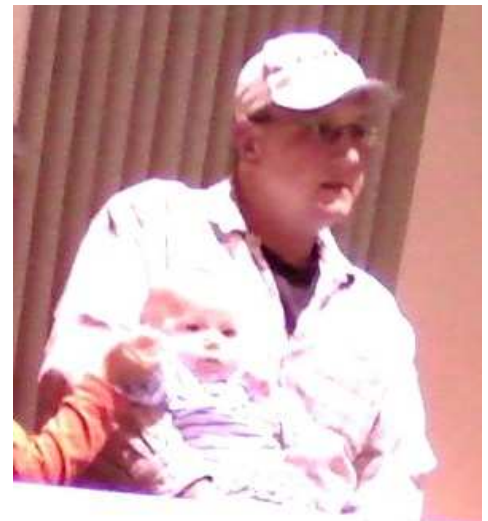
Another future member