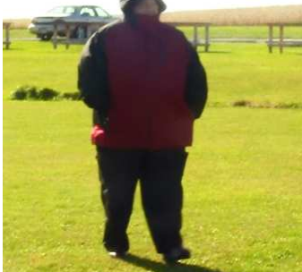
Club officers, Field inspection