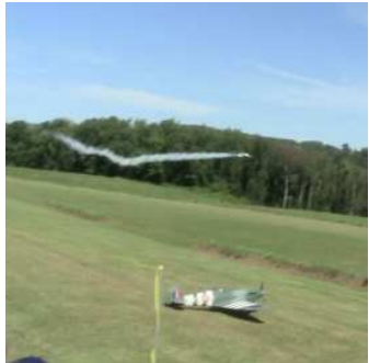
Today's and Past Aviation