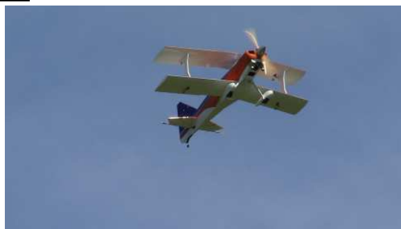
All alone in "Blue Skies"