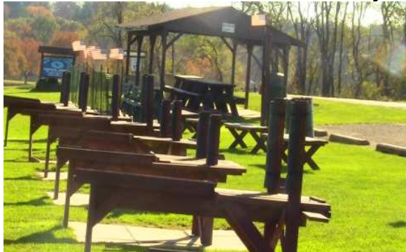
Not a soul to be found (Winds were only 40 mph) Look at the flags waving!!!