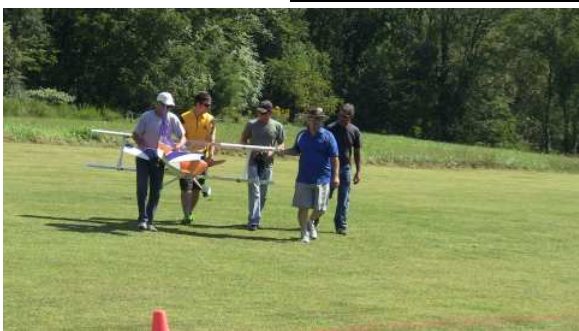
"Paramedics", retrieving mishap